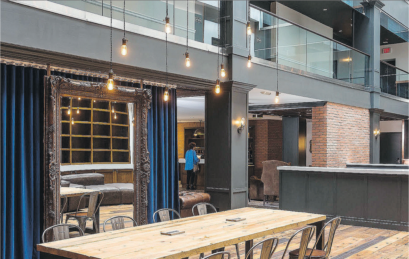
The newly-branded Metcalfe Hotel in Ottawa has renovated and now has a chic lobby lounge. PHOTOS: DWAYNE BROWN STUDIO